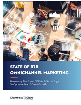
State Of B2B Omnichannel Marketing